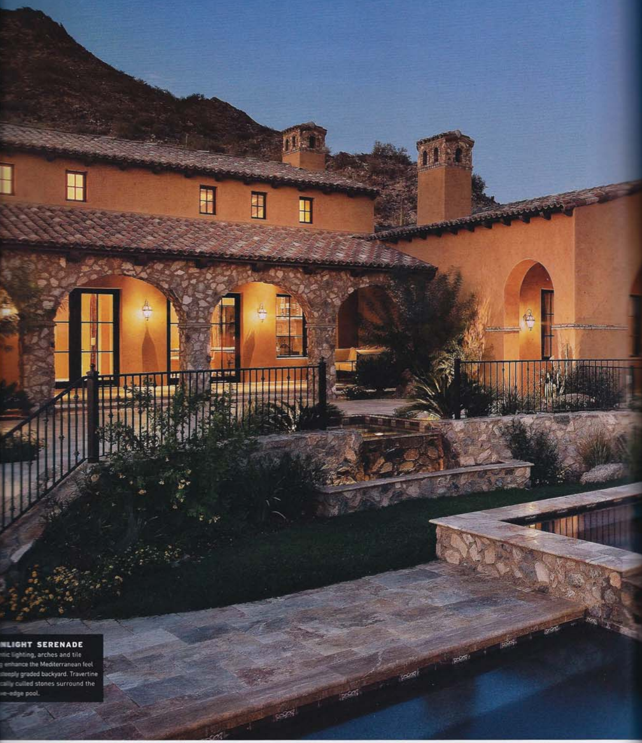
WILDLIGHT SERENADE Ambient lighting, arches and tile enhance the Mediterranean feel. The steeply graded backyard. Travertine and locally culled stones surround the infinity-edge pool.